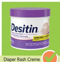
Diaper Rash Creme